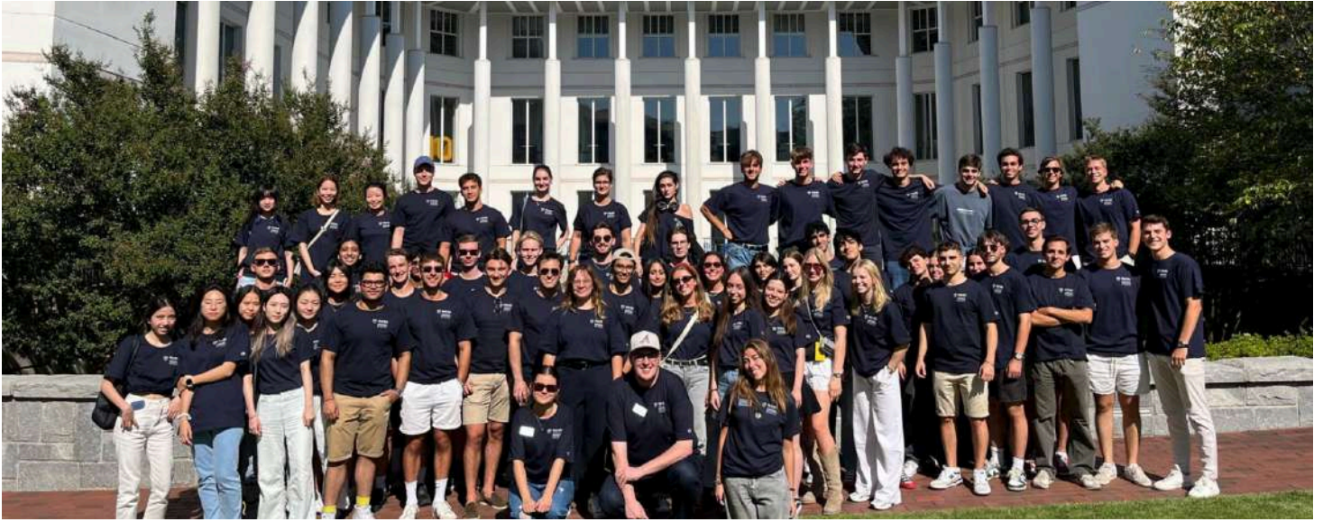
Emory Inbound BBA Exchange Class Fall 24'